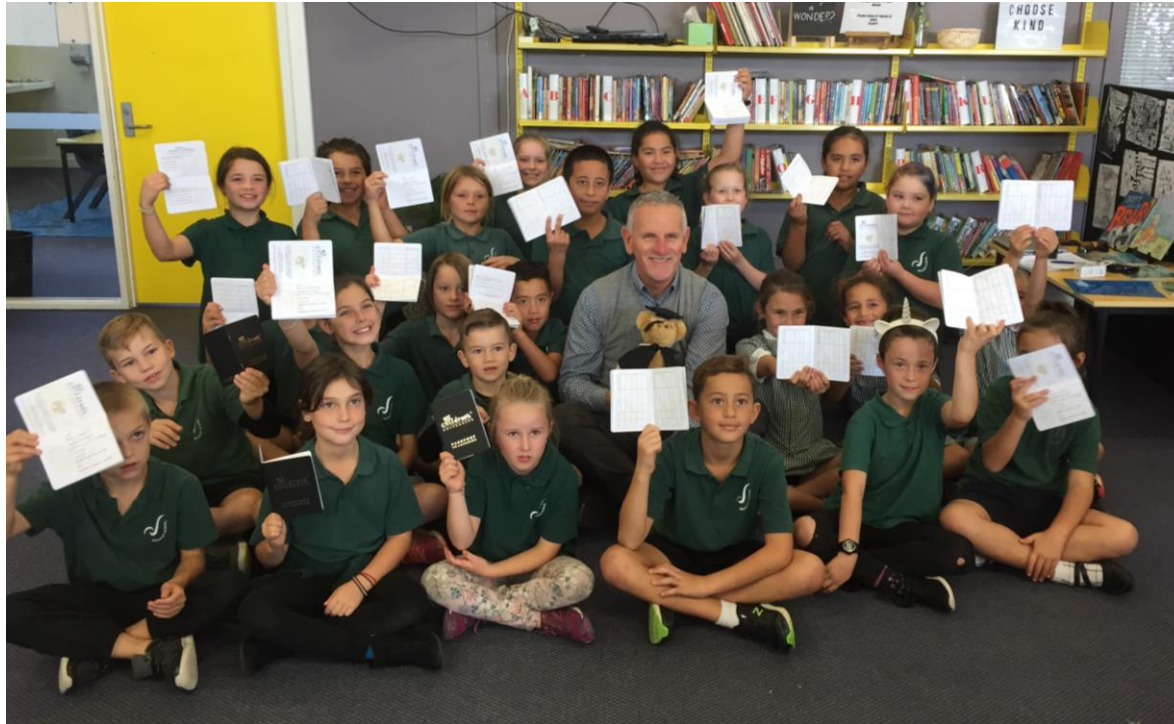
Bromley School Members 2019