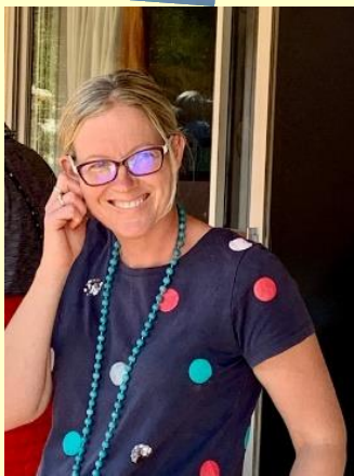
Mt Aspiring Station: Photography: Russell McGeorge