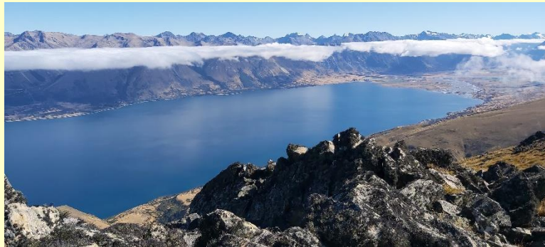
Tutu clouds around Ohau mountains, Sandra Binney

Another stunning photo on the subject of cloud formations: