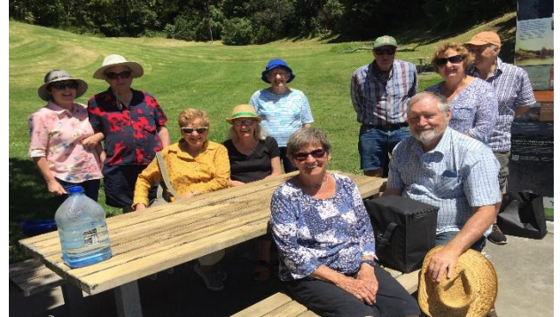
Members of the NZ History group at Taurarua