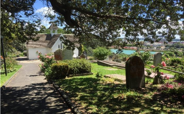
St Stephens Church

Next meeting: 14 February 2021 Venue: New Lynn