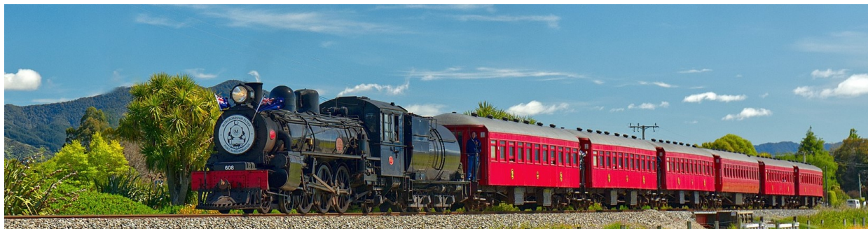
Marlborough Flyer