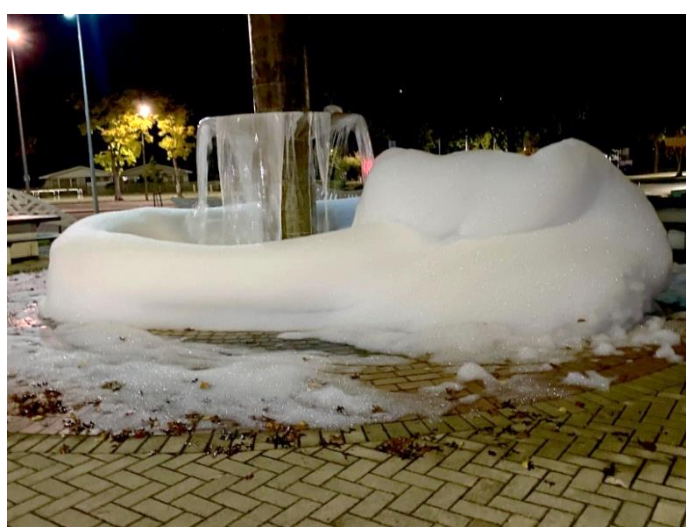
Early morning walk in the Village by Beryl Grayling. Bubble bath anyone?