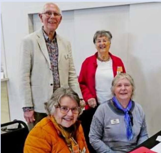
Members of Science Today 2 greeted everyone attending the Tauranga General Meeting in September.