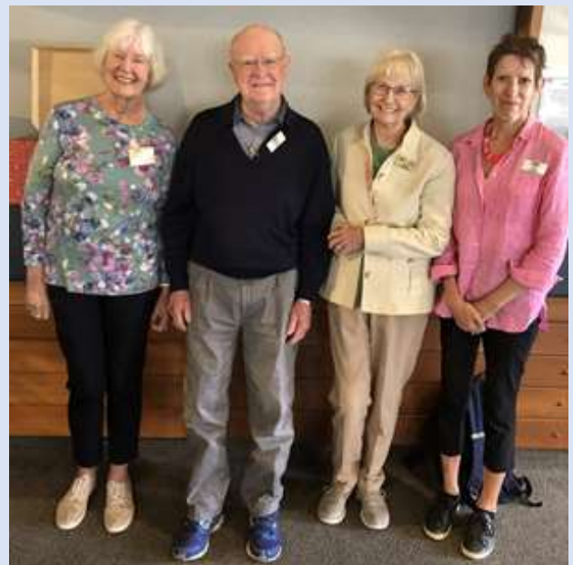
Members of Shakespeare A gave a warm welcome to those who came along to the Tauranga General Meeting in October.