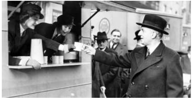
Woolton Pie (left) and Lord Woolton himself, pictured accepting a cup of tea from a wartime mobile canteen (above).