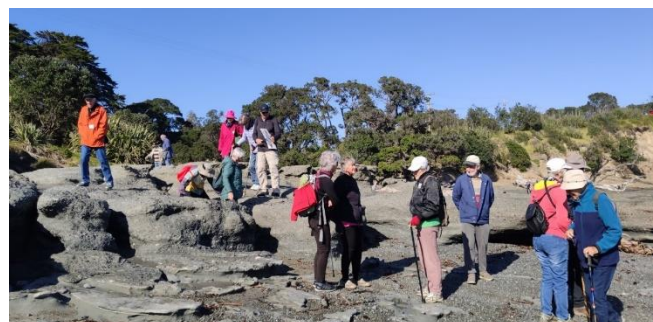
Members of the Geology Group inspecting the coastal rock outcrops below Goat Island's Marine Discovery Centre.

The perfect weather and low tide enabled the group to leisurely amble across the wave-cut platform while inspecting the sedimentary rock strata below and above it. This site is geologically similar to that at Matheson Bay, visited earlier this year, where the basal deposits of the 800m thick Waitemata Group of sedimentary rocks are particularly well exposed. Known as the Kawau Subgroup, these interbedded layers of shallow marine sediments represent 20-million-year-old ancient beach and subtidal conglomerates and sandstones.