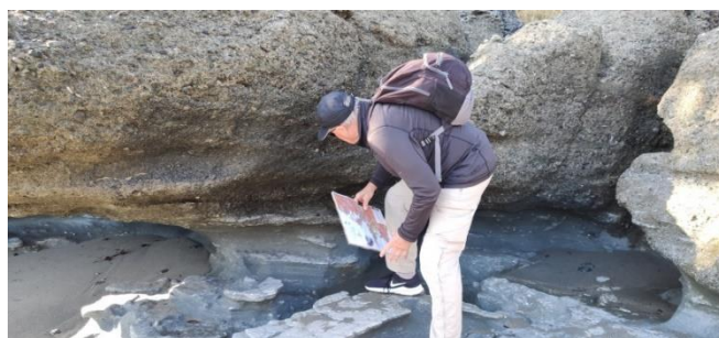
Willo indicates the geological contact between the bioturbated sandstone and the overlying conglomerate.

At Goat Island, a gritty conglomerate deposit containing fossilised shell fragments forms the prominent Cape Rodney Formation unit onto which the wave-cut platform was bevelled, and which continues along the adjacent cliff face below the Centre. Beneath the conglomerate is a coarse-grained, grey coloured sandstone unit with interbedded, thin lenses of fine grained, whitish